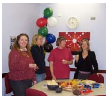
Staff in Moora celebrate NAIDOC week.