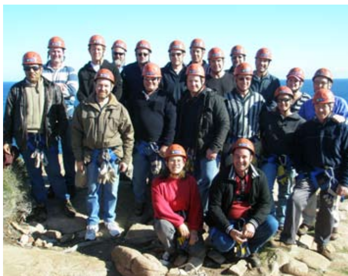
Members of the South West Invasive Species team

"It was great to test your limits to work as a team and I also got some inspiration and new ideas to put in place in the work place during our night time discussion."